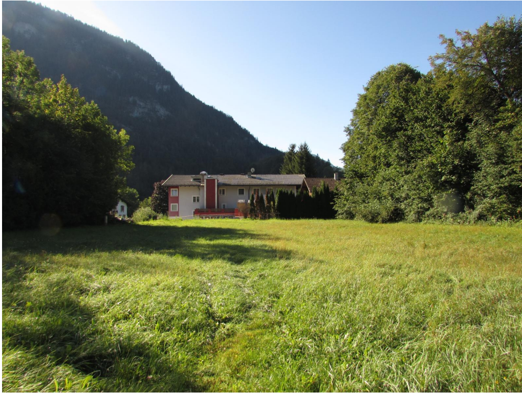
View to the south from the entrance to the property.