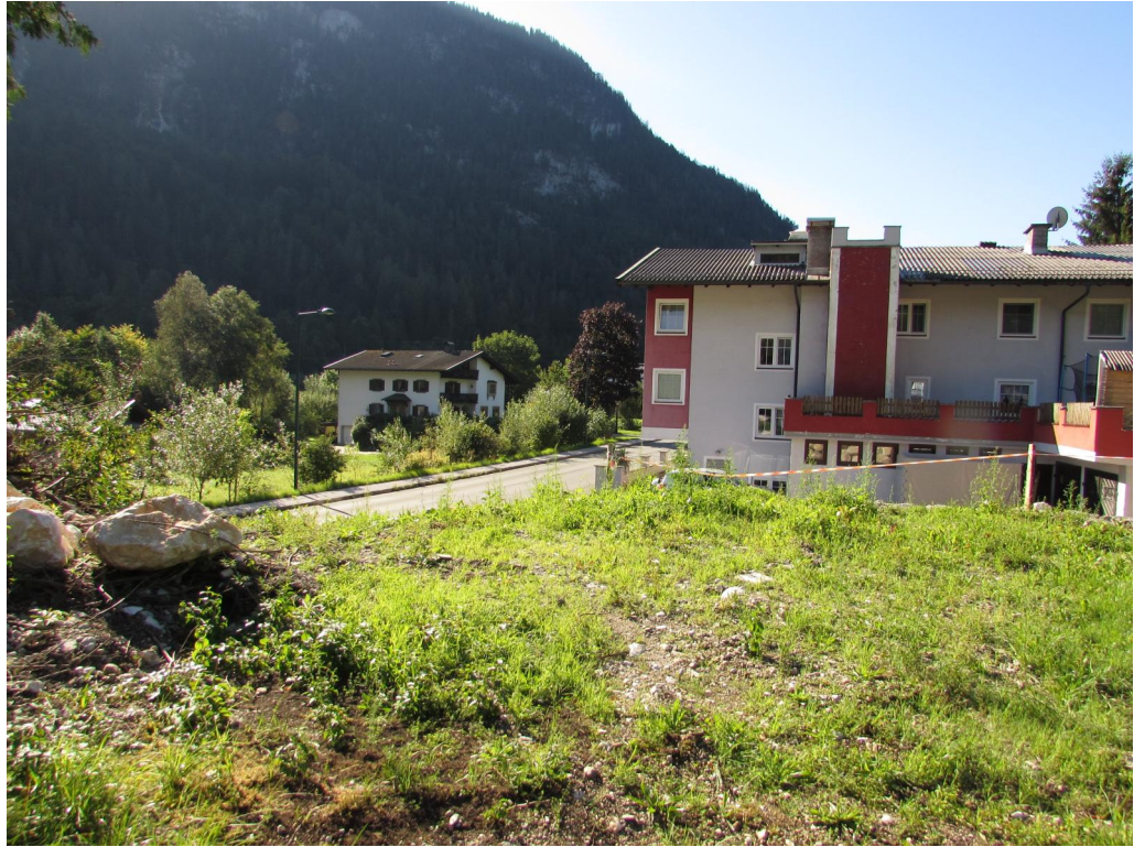
View from the southeastern corner of the property in southeast direction.