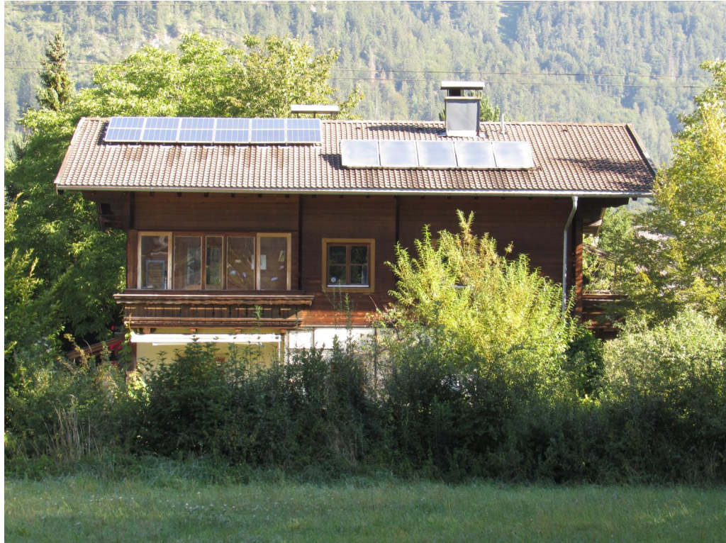
View from the south of the property in direction to the northern neighbour east of the access road.

This is very convenient to feed in the unusually large amount of solar power.