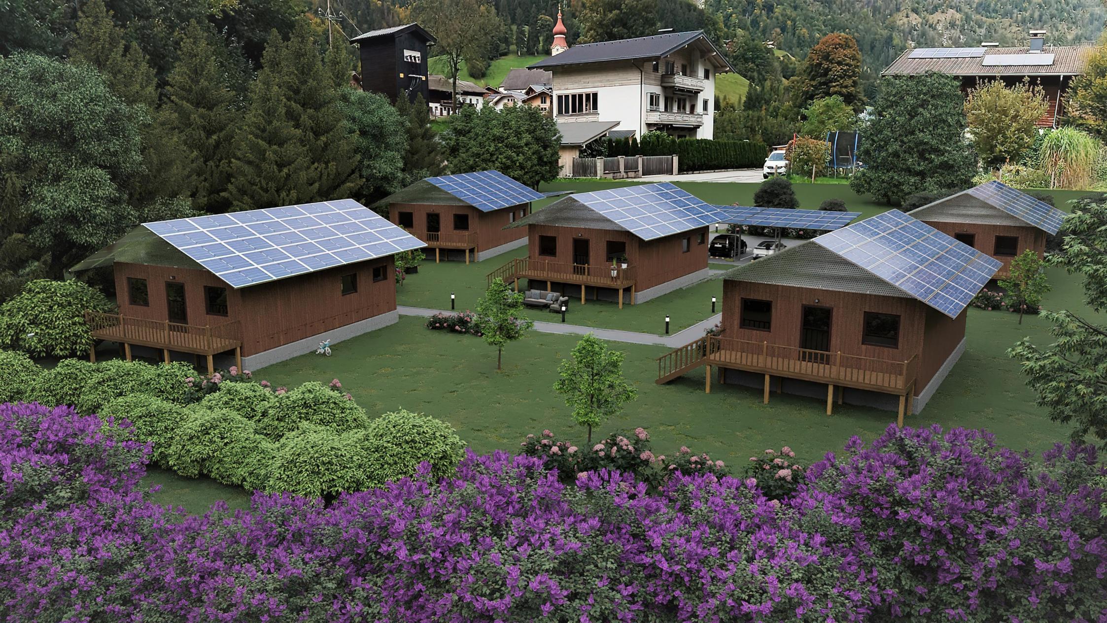
GEMINI next Generation in Unken