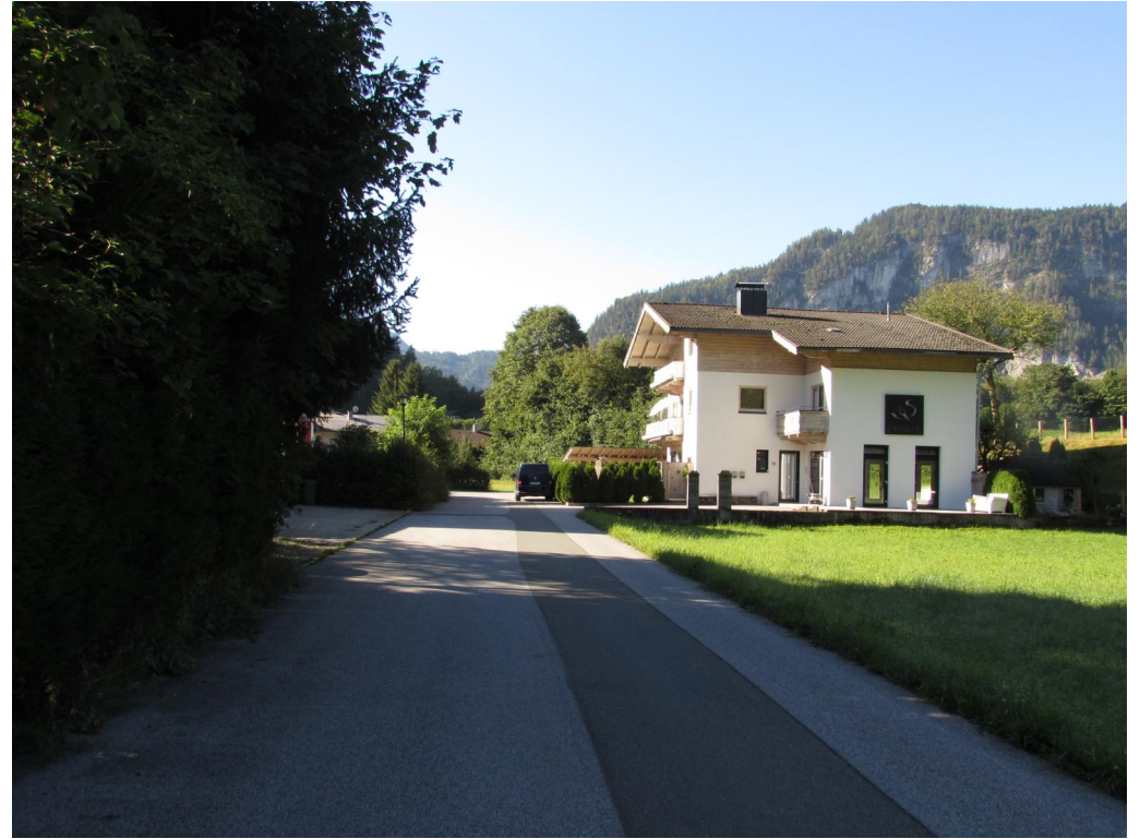
The dead end road to the south just in front of the property.