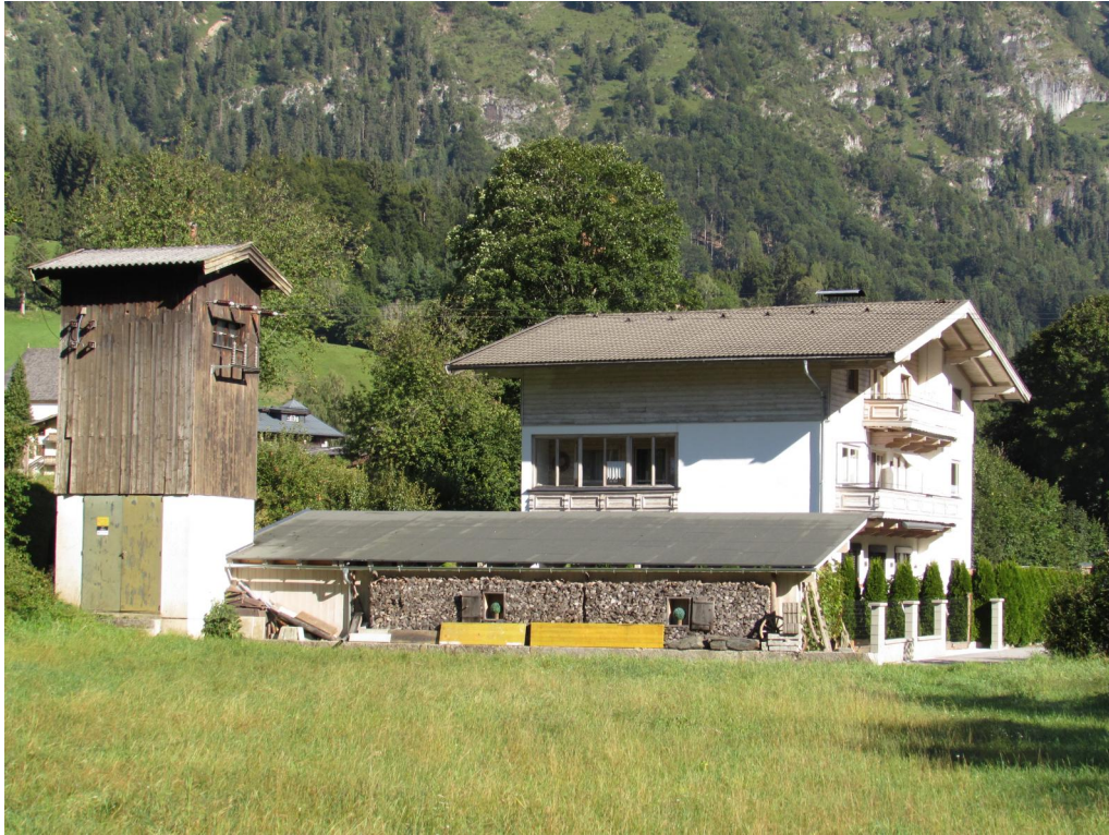
Panoramic view from the south of the property in direction to the northern neighbour west of the access road. On the left is a transformer station of Salzburg Netz GmbH.

This is very convenient to feed in the unusually large amount of solar power.