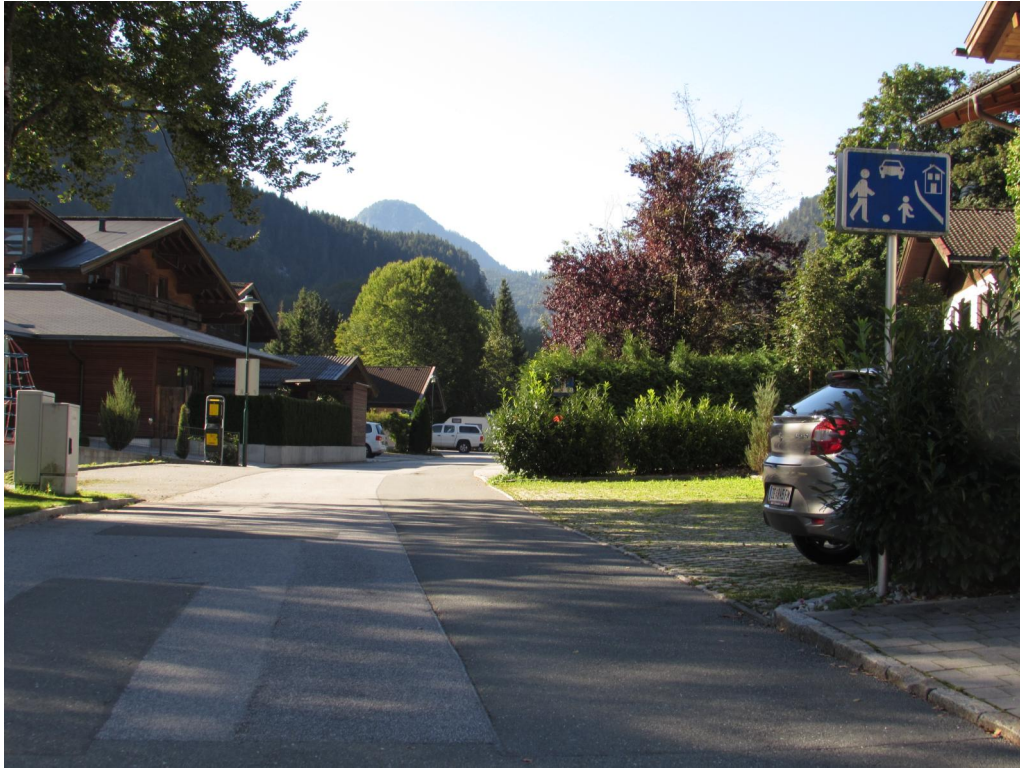
Coming from Unken municipality to the south is a dead end street.